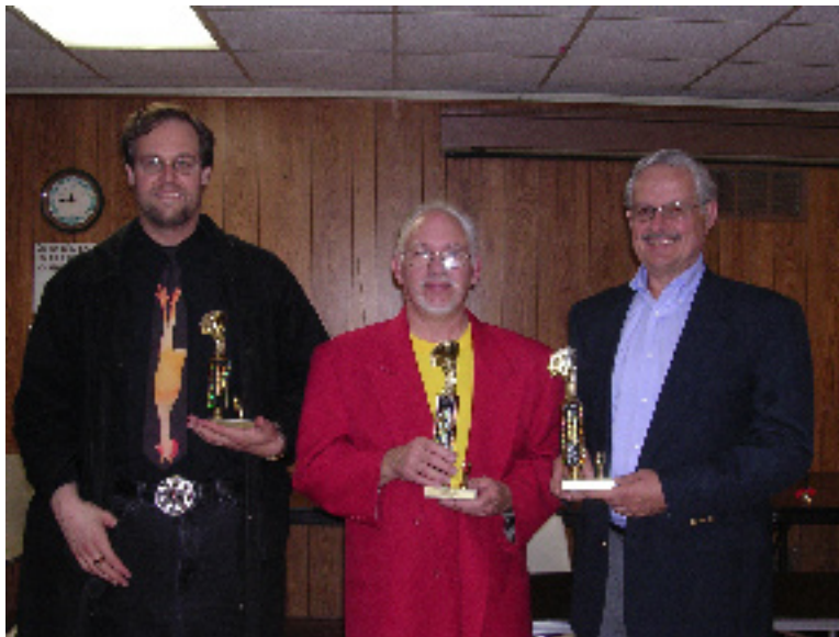
WELL DONE GENTLEMEN!!!