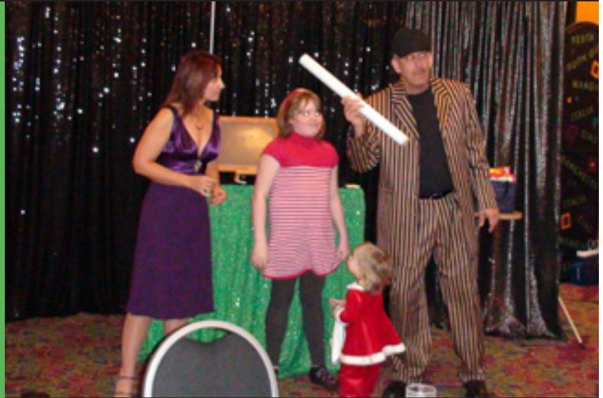
Is this how you shake your Christmas presents??