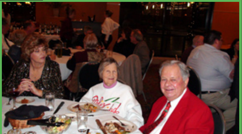
What a cute couple! Anybody know who they are?