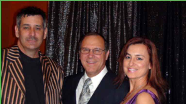
Has anyone ever noticed Todd always hangs out with the pretty girls?